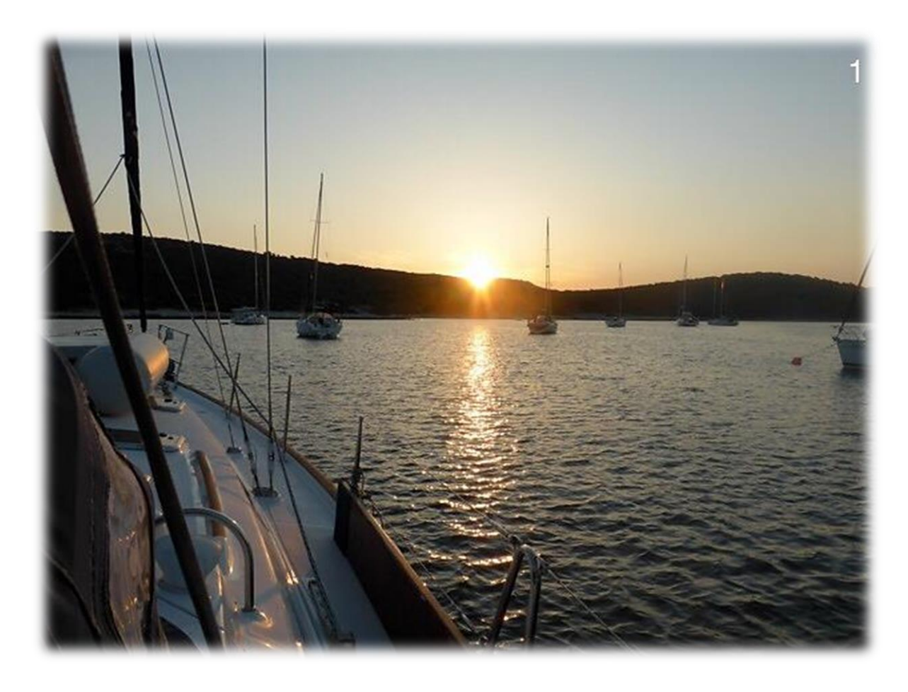
Commodore's Lunch Photo competition winner

Back Cover Inside: A Limerick from the Autumn Rally of 1983