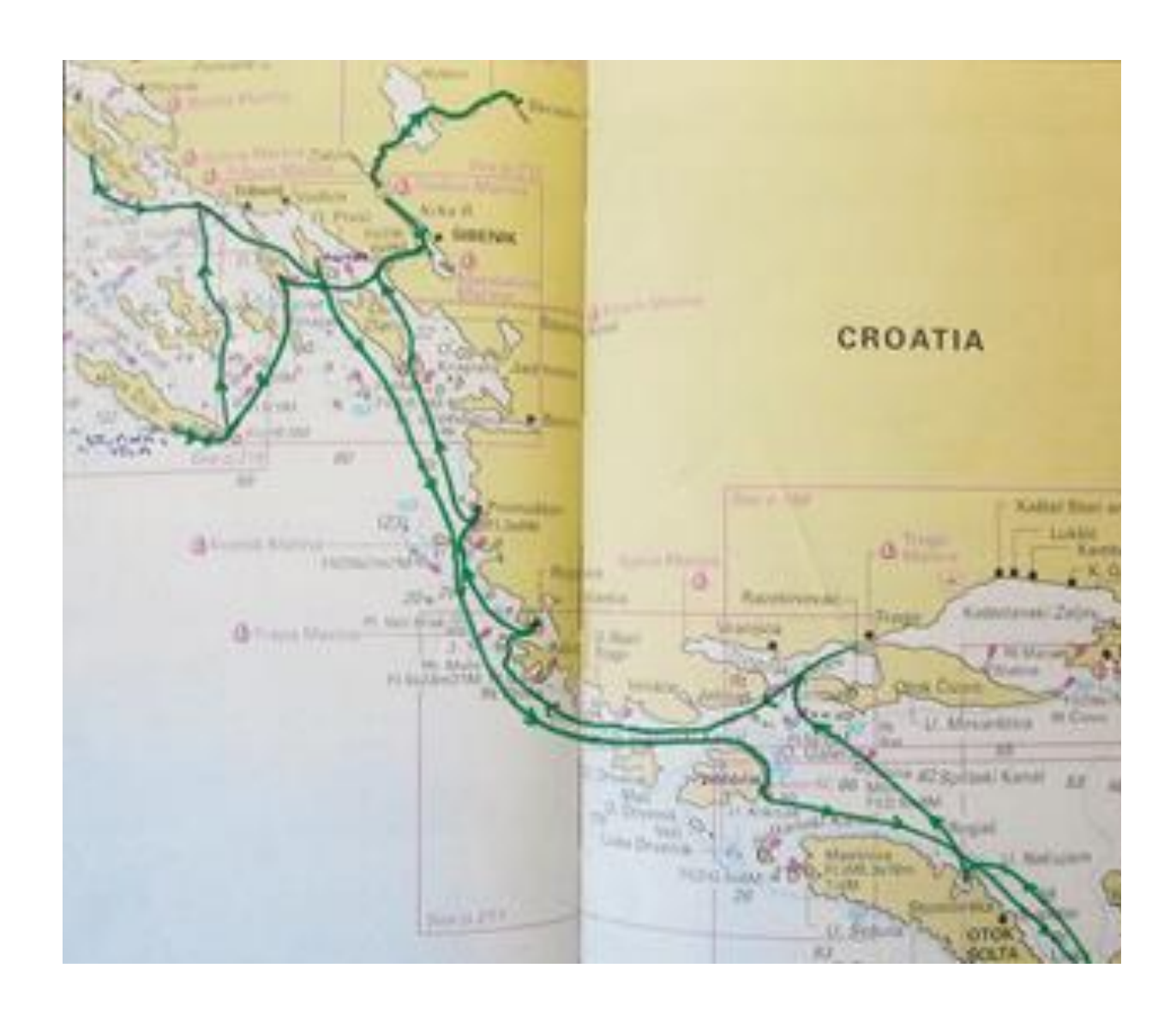
CHART OF OUR TRAVELS IN 2014

We have enjoyed sailing in Croatia in the last 2 years so much that we are planning to explore the area further north in 2015 – based on Zadar, another World Heritage City. From a sailing point of view, the winds are so dependable and the sheer number of islands, to navigate through, makes for a very interesting sailing experience.