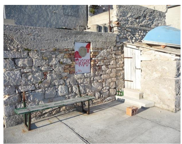
Massage Parlour – door on right!

We had noted that there were 4 restaurants. We chose the Hotel