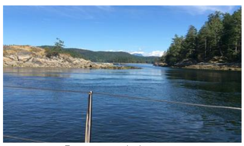
Entrance to squirrel cove

promised that the water was heated all summer and was the warmest in Canada! The walk turned into an assault course with ropes that had been put up to traverse rocks etc.