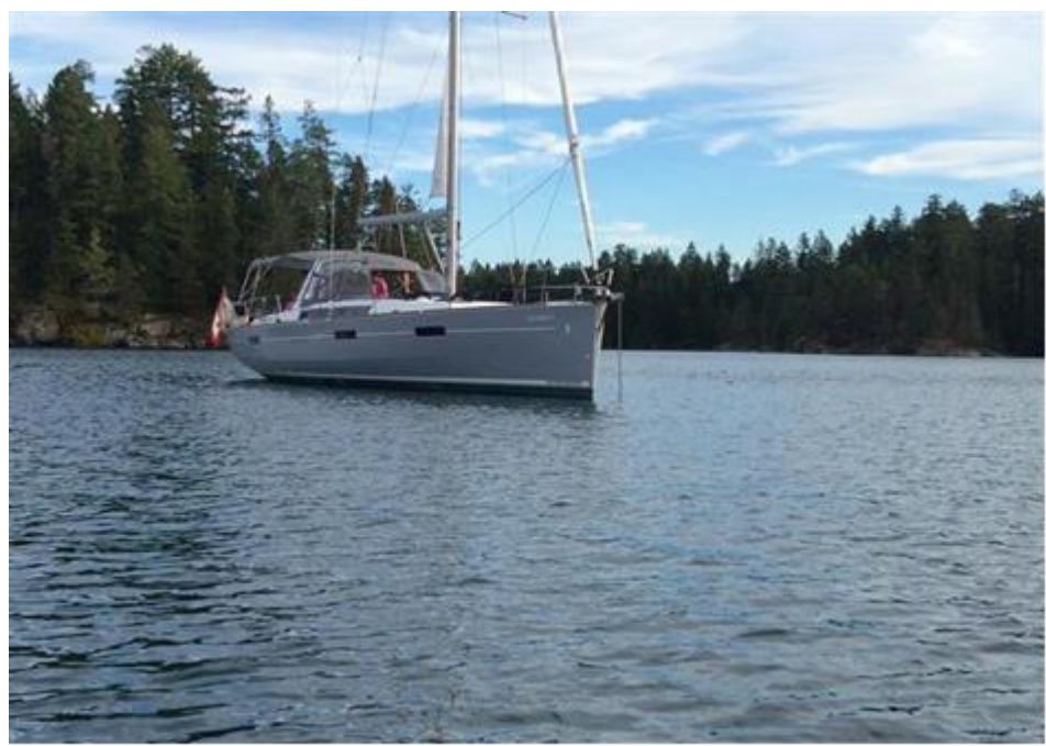
The Hartaro anchored at Squirrel cove

There is a small marina here with a restaurant above it, so we were alongside with mostly motor yachts but they were a friendly bunch. Mooring up being greatly eased by the bow thruster! There was also a swimming pool which we took advantage of; the sun was still shining brightly. We had done about 36 miles and arrived at 3.00 pm.